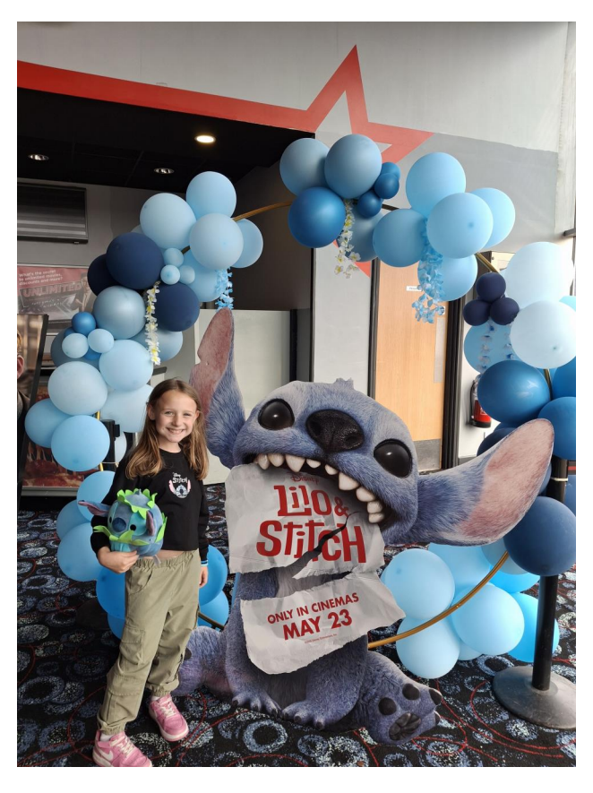
15 - April enjoyed the new Lilo and Stitch movie