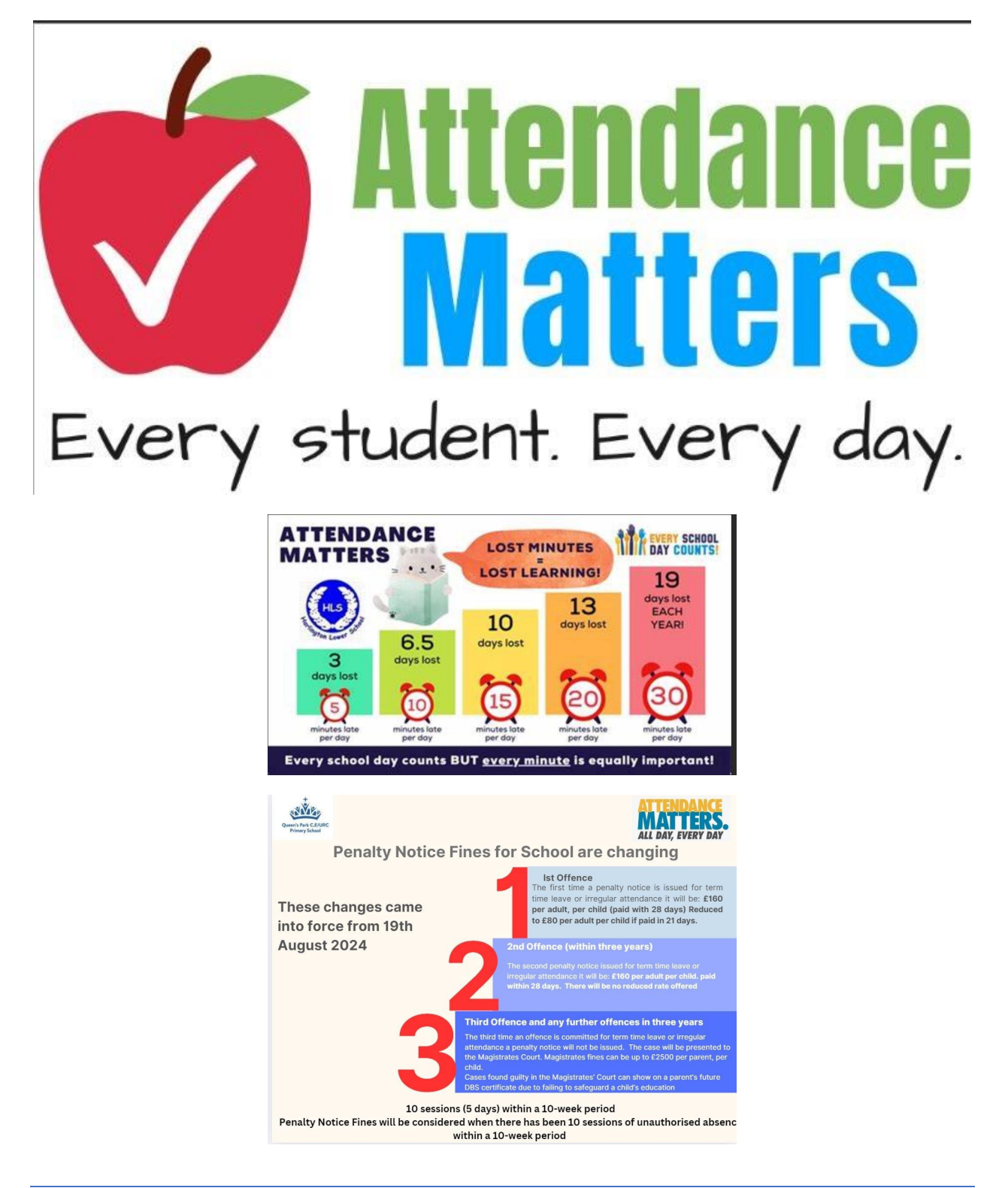
337 children had perfect attendance last week! Can we beat this next week?