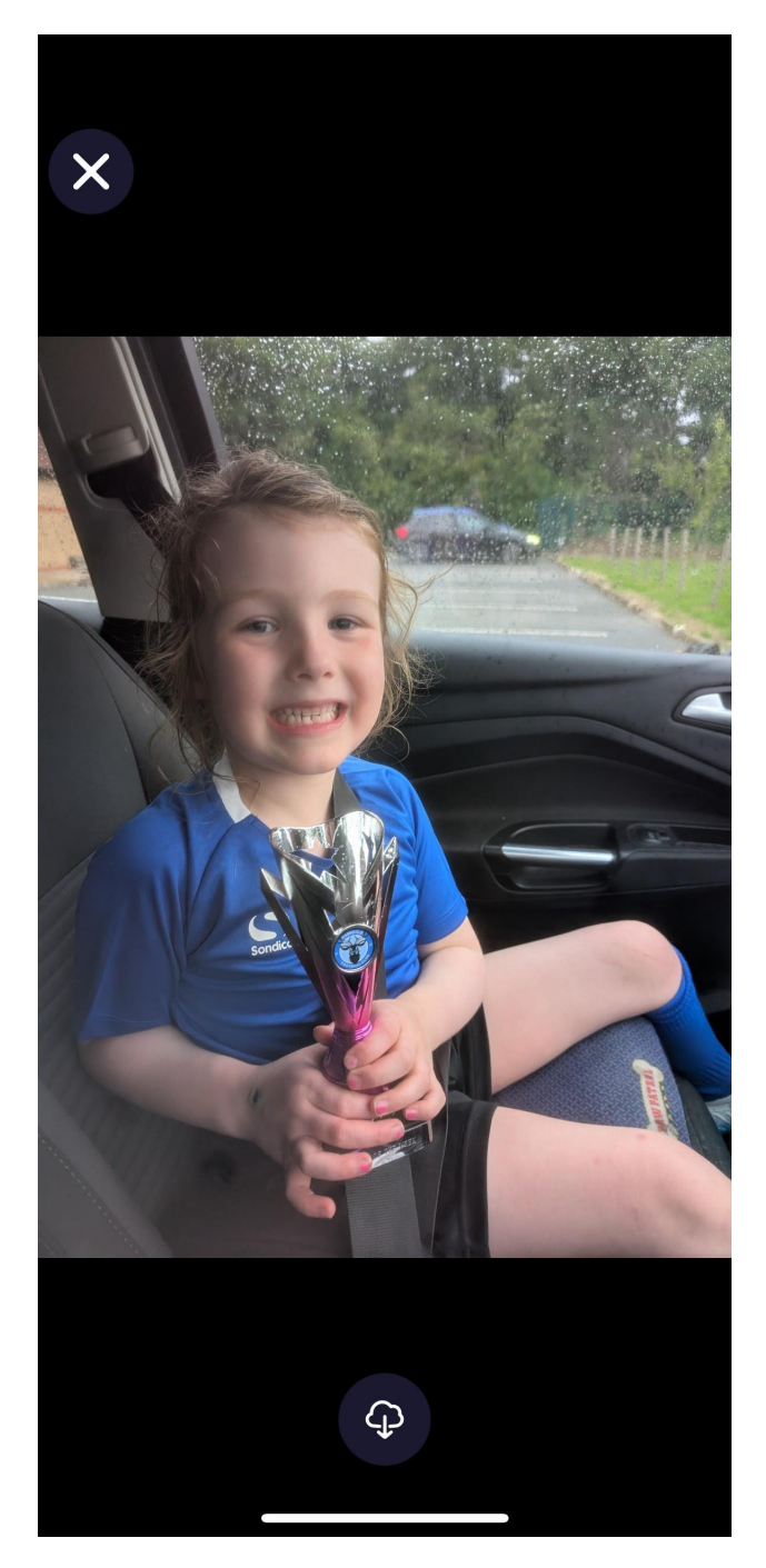
4 - and got star of the week in her first football session!