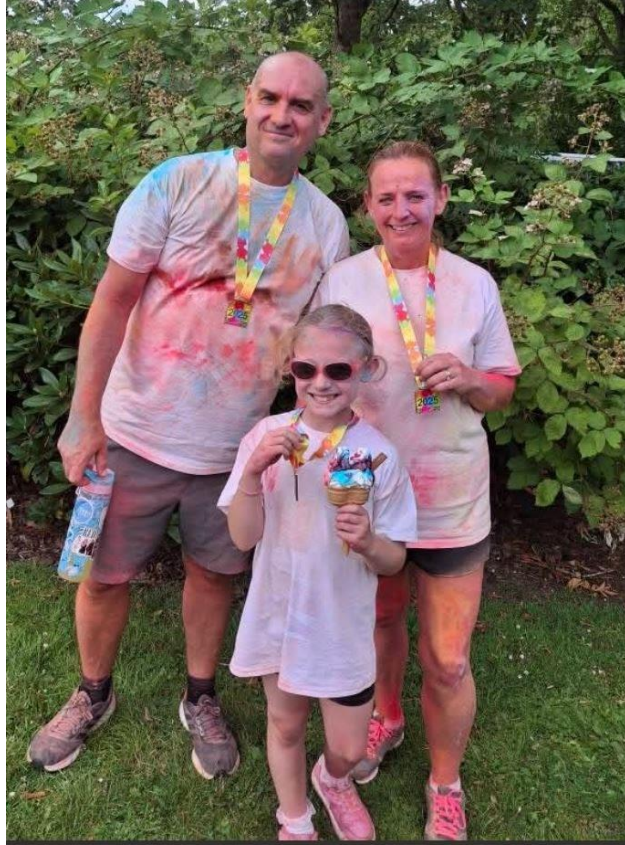
1 - At the weekend April took part in the Colour Run and raised money for Willowbrook Hospice.