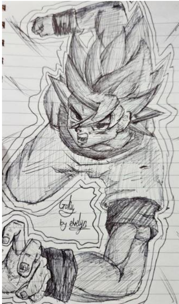
2 - Some wonderful art work from Eve in Y6