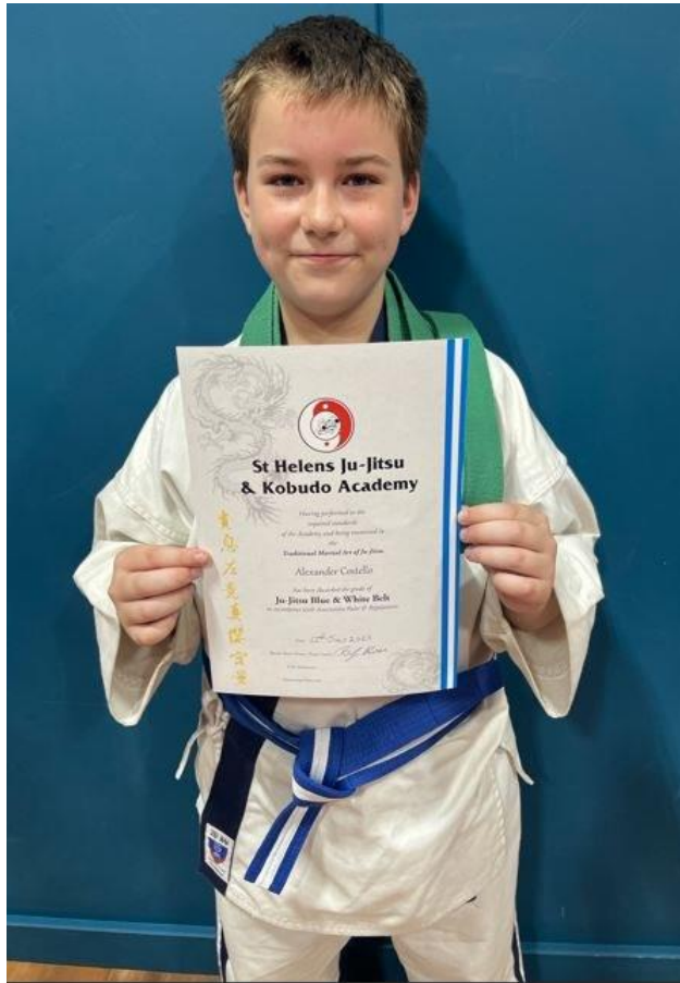
5 - He completed his blue and white belt grading in jujitsu before the summer holidays.