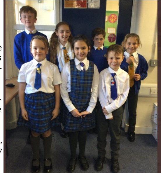
Queen's Park Junior Leadership Team